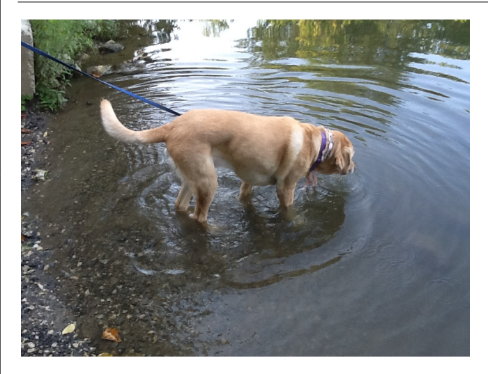
Straight into the water this time