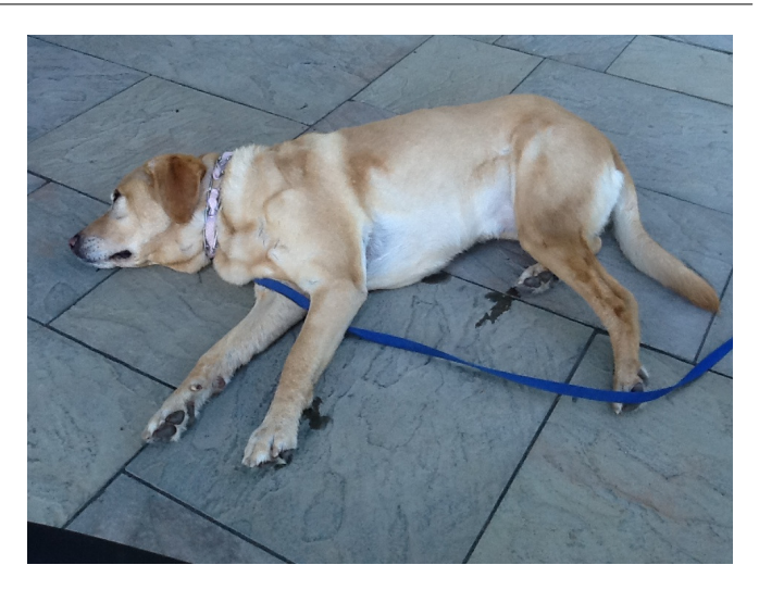
Relaxing and drying after a visit to the river